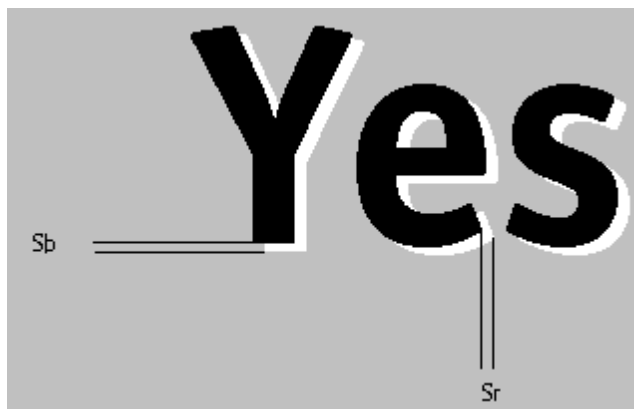
Figure 4.2. Example Drop Shadow

Figure 4.3 shows an example of outlined text. For outlines the line thickness is specified.