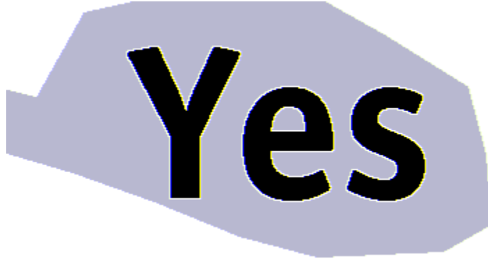
Figure 4.3. Example Outline