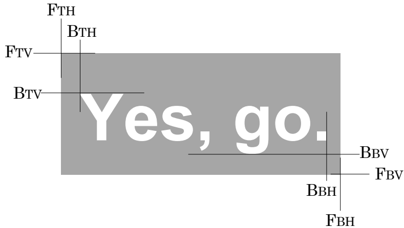
Figure 4.1. Placement of Bitmaps and Frames